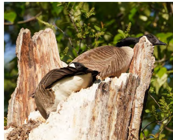
A pair of Canada geese nest atop a chimney snag at Owen Sowerwine

If you would like to learn firsthand about the Owen Sowerwine property and project, several walking and kayak tours will be offered in July. About 75 people enjoyed tours of Owen Sowerwine given by Flathead Land Trust, the Flathead Audubon Society, Flathead Lakers and the Flathead Lake Biological Station in May. You can donate to the project or learn about tours at www.flatheadlandtrust.org .