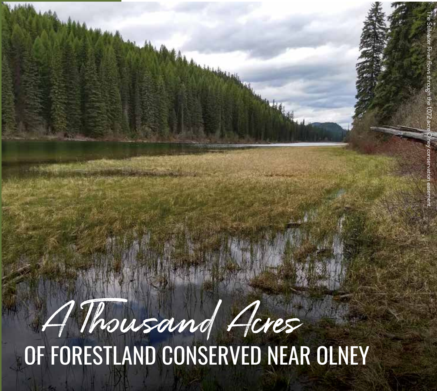
The Stillwater River flows through the 1072-acre Olney conservation easement.