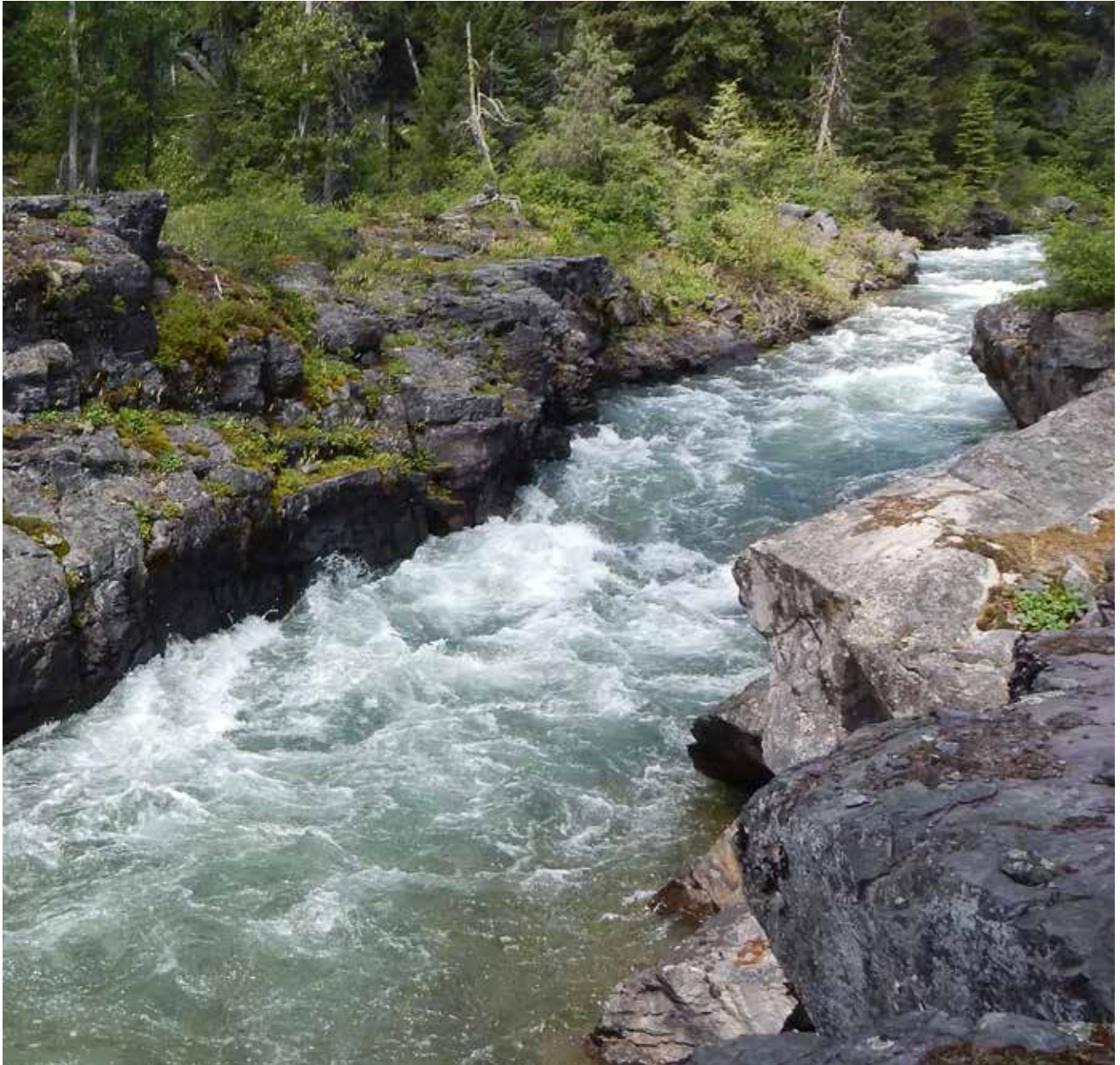
Stillwater River on the new Olney conservation easement