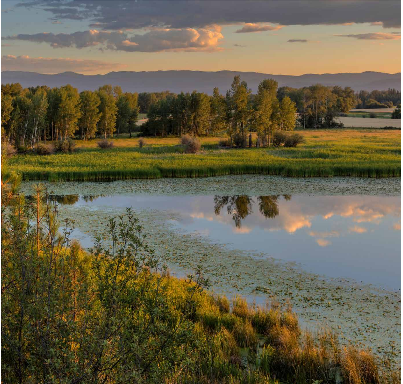
Summer evening on McWenreger Slough near Kalispell.