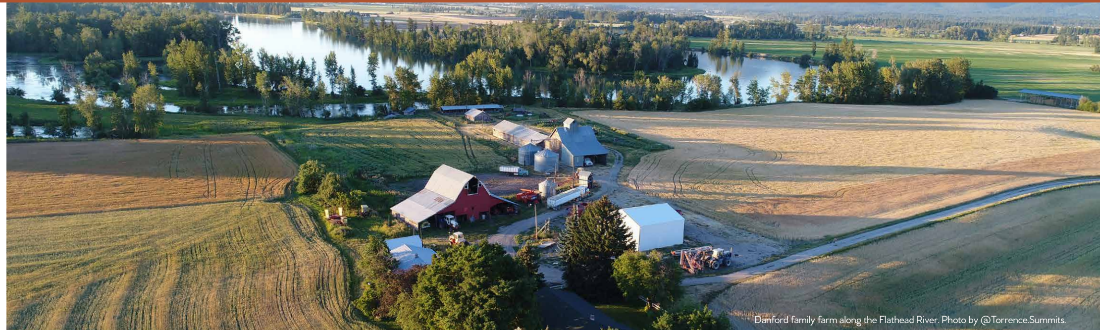
Danford family farm along the Flathead River.