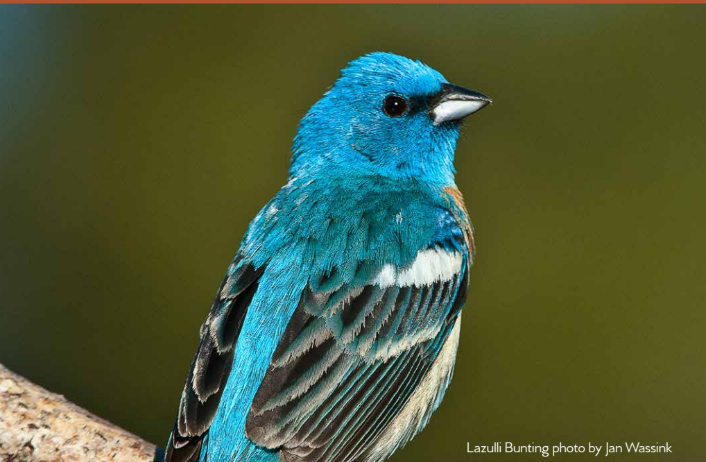
Lazulli Bunting