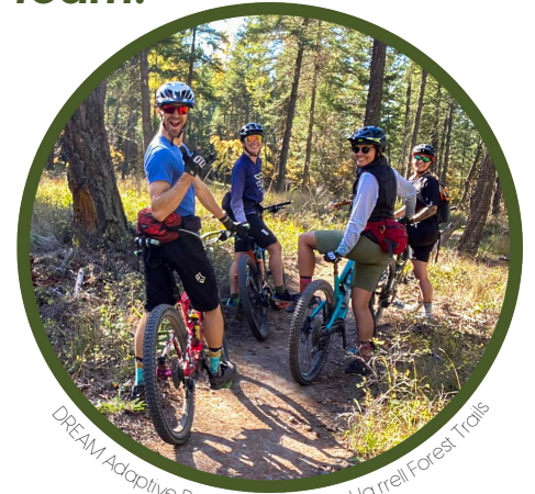
DREAM Adaptive Recreation staff on Harrell Forest Trails