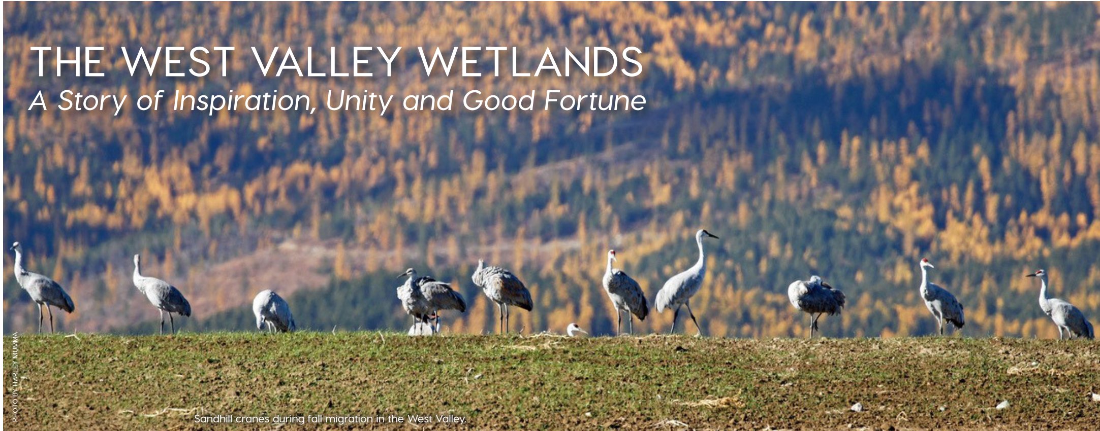
Sandhill cranes during fall migration in the West Valley.