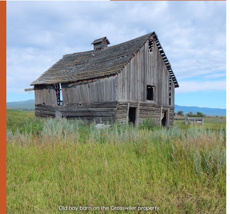
Old hay barn on the Grosswiler property.

Experiencing hundreds of sandhill cranes flying in to roost at sunset is at first exciting and awe-inspiring listening to the raucous din of their captivating calls. As flock after flock of the majestic birds continue to come in from all directions and land, you forget about all else while enjoying their grace and elegance. As the light levels grow low and the cranes settle in for the night, you feel peace, serenity, and contentment. These emotions stir the heart and are good for the soul.